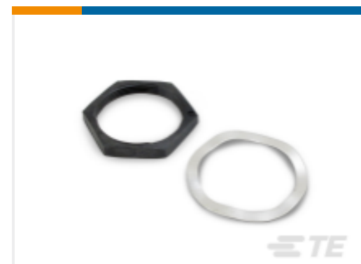
TE Model / Part #2414-001-2486 DEUTSCH HDP20 MOUNTING HARDWARE