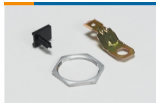
Other Automotive Connector Accessories(13)