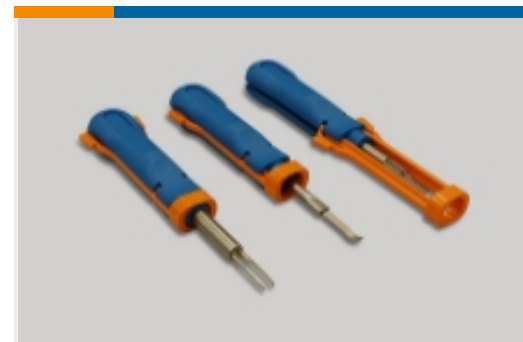
Insertion &amp; Extraction Tools(7)