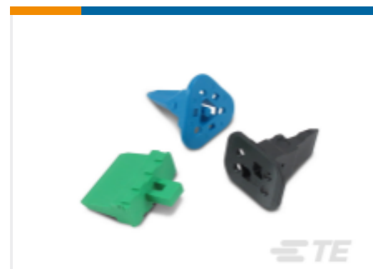
TE Model / Part #W3P-1939 DEUTSCH DT WEDGELOCKS