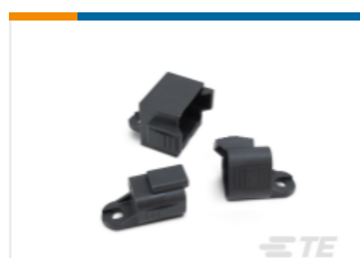
TE Model / Part #1011-346-0405 DEUTSCH DT DUST CAPS