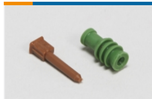
Automotive Seals &amp; Cavity Plugs(4)