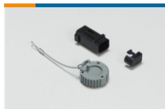
Automotive Connector Caps & Covers (71)