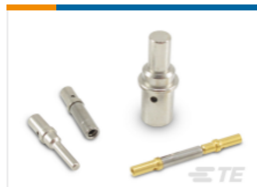
TE Model / Part #0462-203-08141 DEUTSCH SOLID CONTACTS