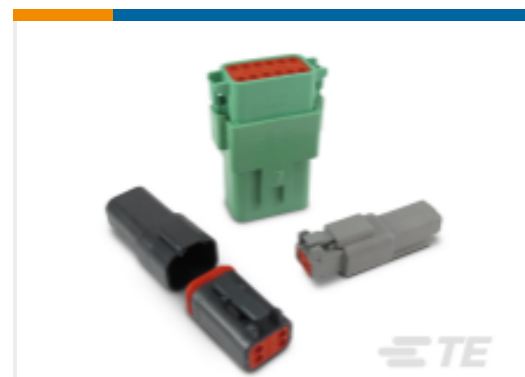
TE Model / Part #DT06-3S-P006 DEUTSCH DT HOUSINGS